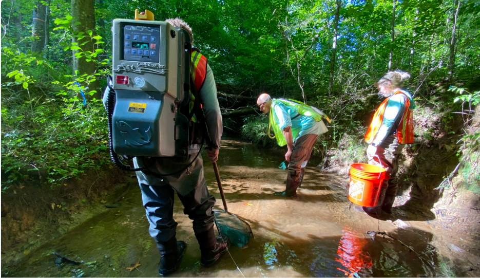
Wildlife Biologists Monitoring Aquatic Species

Wildlife biologists have completed studies of the aquatic species to ensure that no threatened or endangered species live in or around the pit.