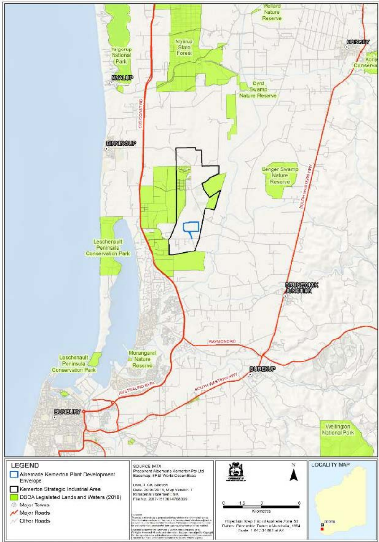
Figure 1-1: Project Site Regional Location