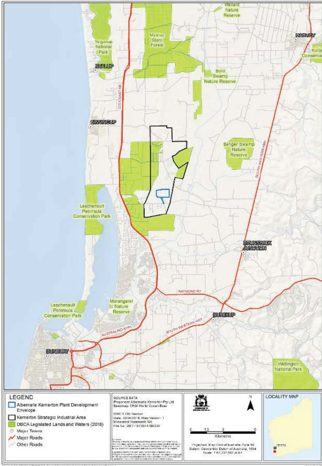
Figure 1-1: Project Site Regional Location