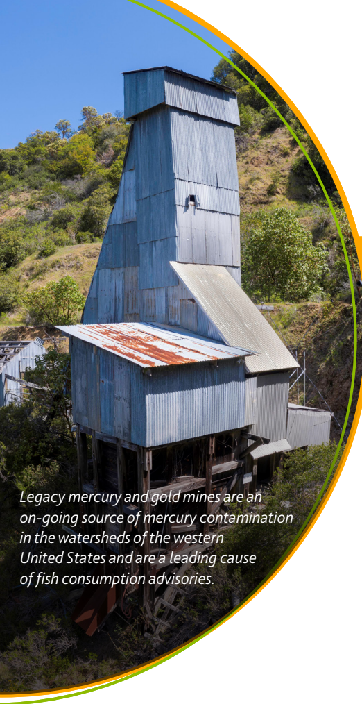
Legacy mercury and gold mines are an on-going source of mercury contamination in the watersheds of the western United States and are a leading cause of fish consumption advisories.